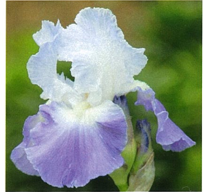
'Clarence' (L. Zurbrigg, 1991) [AM]

Summer rebloom was dismal in Central Virginia for the second year in a row. Weather is a study in extremes. Gardeners must manage expectations despite their best cultural practice efforts. As daytime temperatures cooled down in late September and moisture began to return, would there be any bloomstalks to enter in the AIS Region 4 Fall Flower Show held on October 5th in Richmond? The Recorder's spring edition will provide that answer.