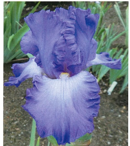
Lockett TB Re Sdlg. #21013A [ML]