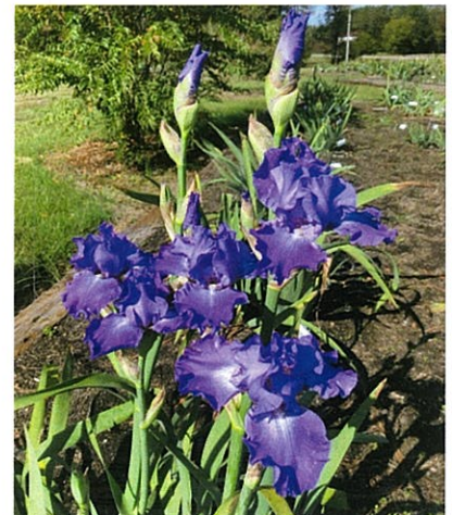
Lockett TB Re Sdlg. #21220-02Re [ML]