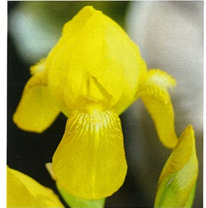
MTB 'Lady Emma' (F. Jones, 1986) [AM]

Lockett TB Re Sdlg. #21013A or ((TB Re Gate of Heaven x Zurbrigg TB SA Re Sdlg.#VV101) X TB Re Metro Blue (Lockett, 2015)) had open flowers on July 25 th . Hyacinth blue blooms have a white area around beards and petals are diamond dusted.