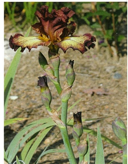
'Double Dare' (M. Locketell, 2014) [AM]