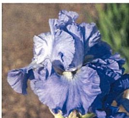
Gate Of Heaven TB (L. Zurbrigg 2004)