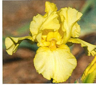
Harvest Of Memories TB ( L. Zurbrigg 1985 )

The "3 and 10" rule (three exhibitors and ten entries) applies for any fall iris show. This requirement should at least be accomplished in Zones 9 through 6. Initial hard frosts in most years occur in late October long after tall bearded cool season rebloom has taken place. The trick is finding the best reliable cool season bearded iris rebloomers in any classification for your micro-climate. The RIS Recorder publishes lists in its fall and spring editions from around the US. There are always common threads to each year's results.