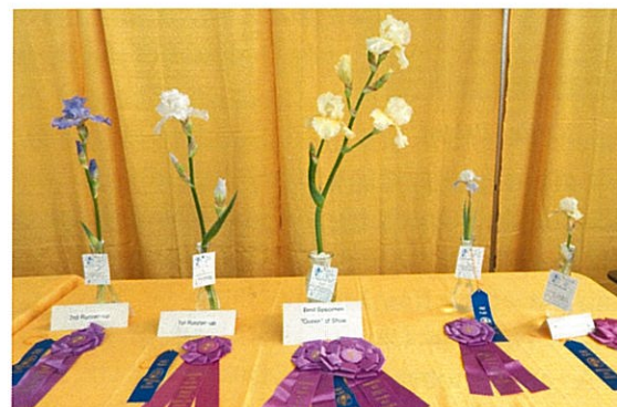
CVIS 2017 Region 4 Fall Awards Table