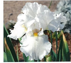
Zurich TB ( M. Byers 1990 )

publicity. The benefits to local iris societies can be significant including new members plus free advertising for upcoming spring flower shows and summer rhizome sales. The AIS Exhibitions Committee can assist any local group with writing an acceptable show schedule. Take the plunge, the effort will be worth it.