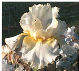
Season Of Mists TB (L. Zurbrigg 2002)